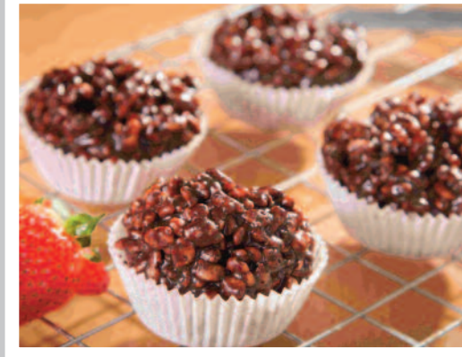
Chocolate Crispy Cake