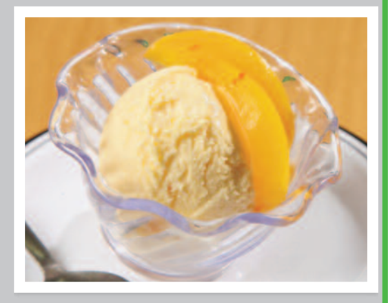
Ice Cream & Fruit