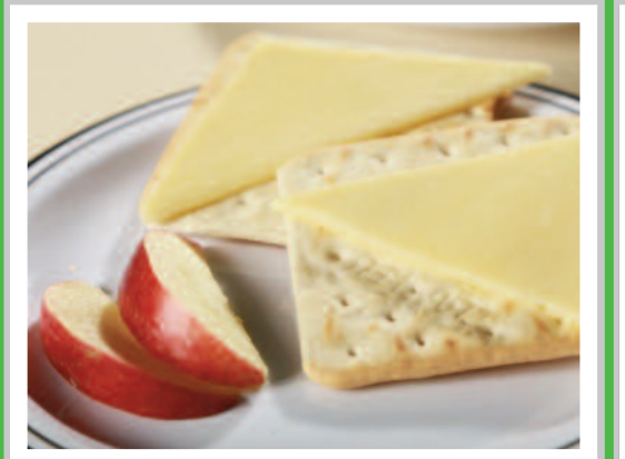
Cheese & Crackers