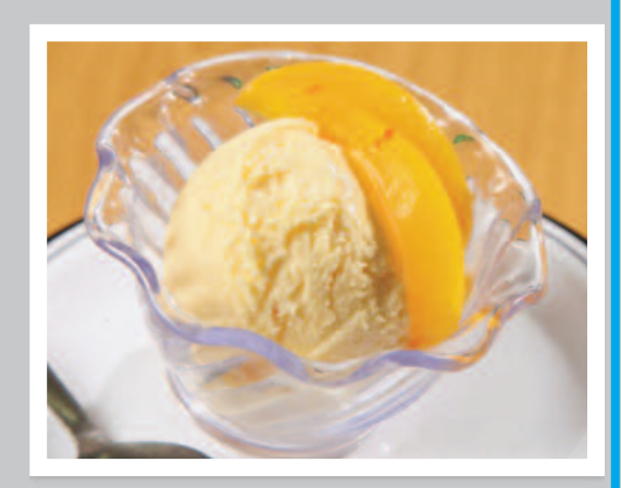
Ice Cream & Fruit