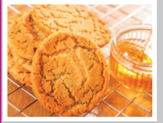
Golden Crunch Cookie

AVAILABLE EVERY DAY - UNLIMITED SALAD, FRESHLY BAKED BREAD, FRUIT YOGHURT & FRESH FRUIT PLATTER. FOR ALLERGEN INFORMATION, PLEASE ASK ONE OF OUR CATERING TEAM. ALL THE ABOVE DISHES ARE SUBJECT TO AVAILABILITY.