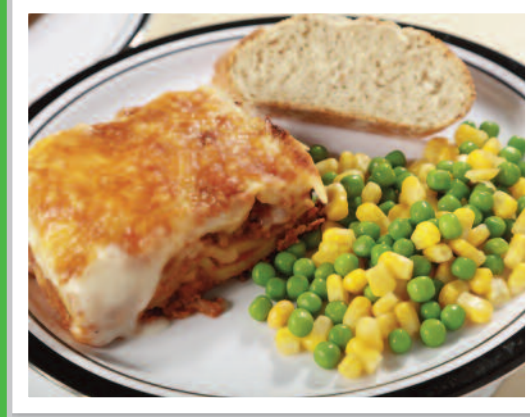
Beef Lasagne served with Garlic & Herb Bread and Seasonal Vegetables