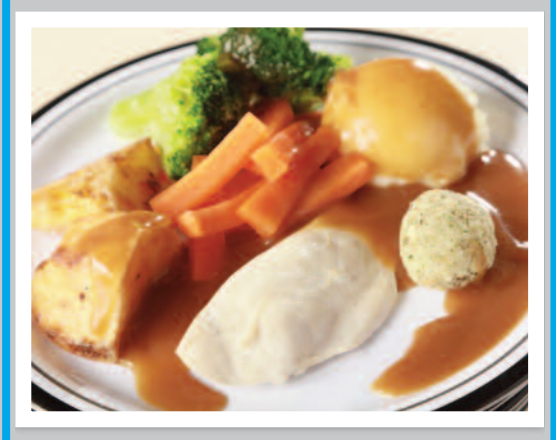
Roast Chicken served with Roast/Mashed Potatoes, Seasonal Vegetables & Gravy