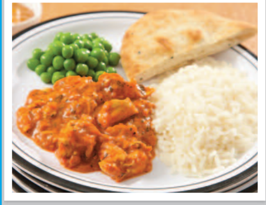
Chicken Tikka Masala served with Rice, Naan Bread & Seasonal Vegetables