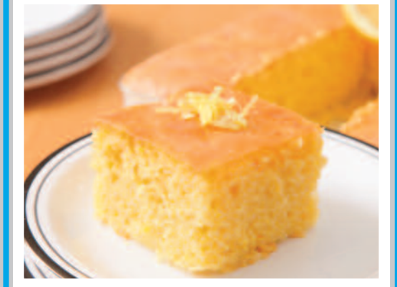
Lemon Drizzle Cake