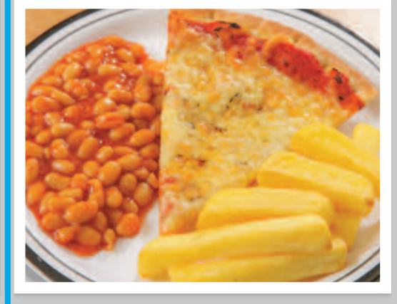
Cheese & Tomato Pizza served with Chips & Peas or Baked Beans