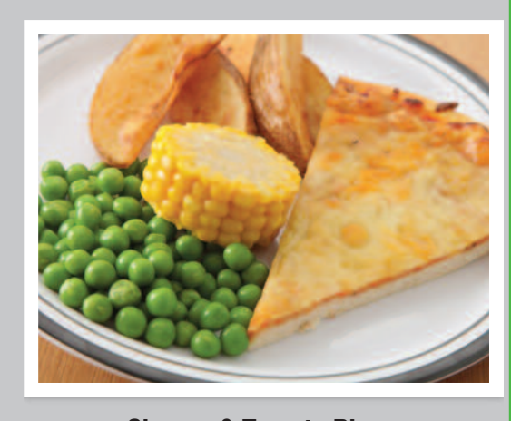
Cheese & Tomato Pizza, served with Potato Wedges & Seasonal Vegetables