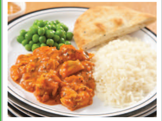
Chicken Tikka Masala served with Rice, Naan Bread & Seasonal Vegetables